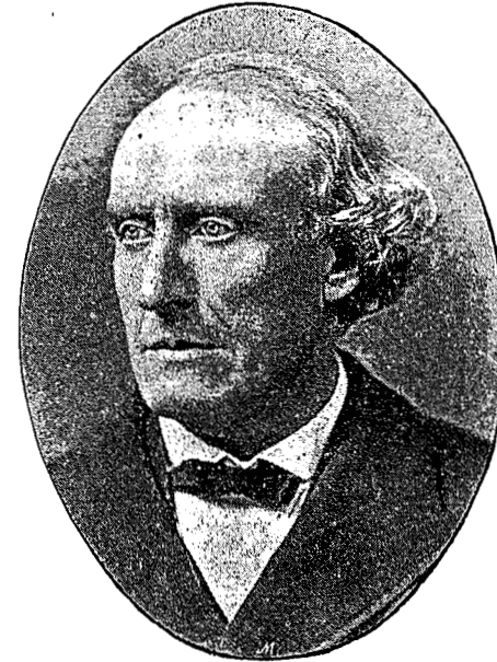
SIR WM. SCOVELL SAVORY, BART.