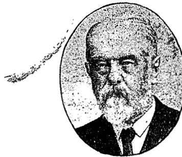
SIR JOSEPH FAYRER, K.C.S.I.