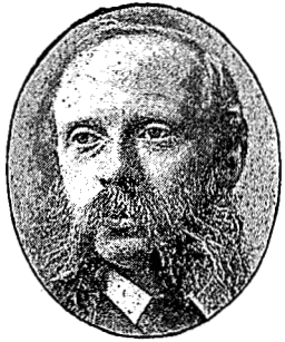
SIR J. CRICHTON BROWNE.