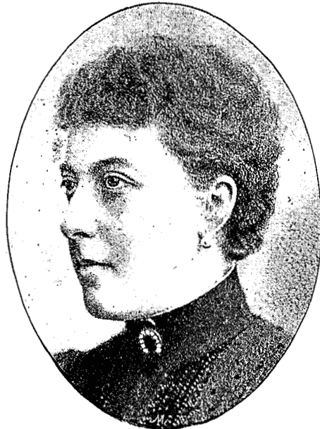
H.R.H. PRINCESS CHRISTIAN.