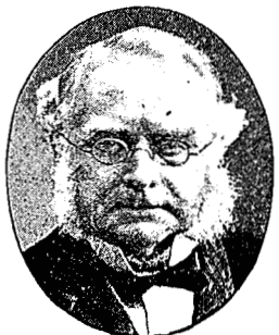
SIR SPENCER WELLS, BART.